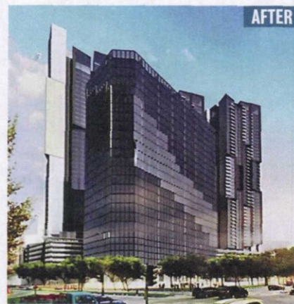
An artist's impression of the revamped Galleria

According to a source, the project will now comprise a 22-storey office tower, a seven-storey carpark, two 43-storey serviced apartment blocks